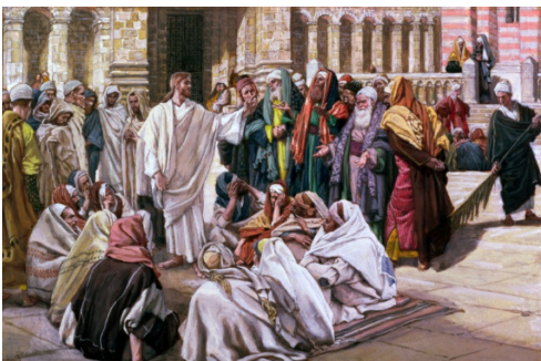
James Tissot: Jesus' Authority Questioned

Mark 11:28-33+ and began saying to Him, "By what authority are You doing these things, or who gave You this authority to do these things?" 29 And Jesus said to them, "I will ask you one question, and you answer Me, and then I will tell you by what authority I do these things. 30 "Was the baptism of John from heaven, or from men? Answer Me." 31 They began reasoning among themselves, saying, "If we say, 'From heaven,' He will say, 'Then why did you not believe him?' 32 "But shall we say, 'From men?'"—they were afraid of the people, for everyone considered John to have been a real prophet. 33 Answering Jesus, they *said, "We do not know." And Jesus *said to them, "Nor will I tell you by what authority I do these things."